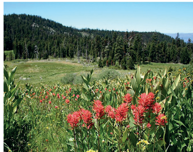
KS Wild Archive

Getting there: A good map can be obtained at the Forest Service office in Cave Junction and is essential for enjoying the trails, peaks and meadows in the Monument. The best access to the cirque and surrounding trails is from road 079. Expect to hike about a mile into the meadows and an additional 1.4 miles to catch the views from the top of Mt. Elijah.