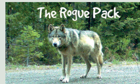
Oregon Department of Fish & Wildlife

Two new wolves, a male and a female have been confirmed to be hanging out just west of Klamath Falls near the Oregon-California border. This makes two groups of wolves in southern Oregon. Southern Oregon's famous wolf OR-7 and his family now have an official name, the Rogue Pack. We think the name makes a good fit for the first confirmed pack here since the 1940s.