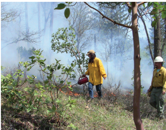
Rogue Valley Prescribed Burn Association

As we enter into fall and cooler temperatures set in, the change in seasons offers us a different way to interact with our landscape. In the Klamath-Siskiyou, this time of year brings an end to the wildfire season. The fall and winter also offer us the opportunity to get more prescribed fire back on the landscape. With more moisture in the air and cooler temperatures, the conditions for intentionally burning the landscape are safer and fire is easier to control.