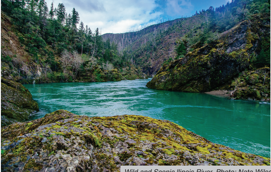
Wild and Scenic Illinois River.