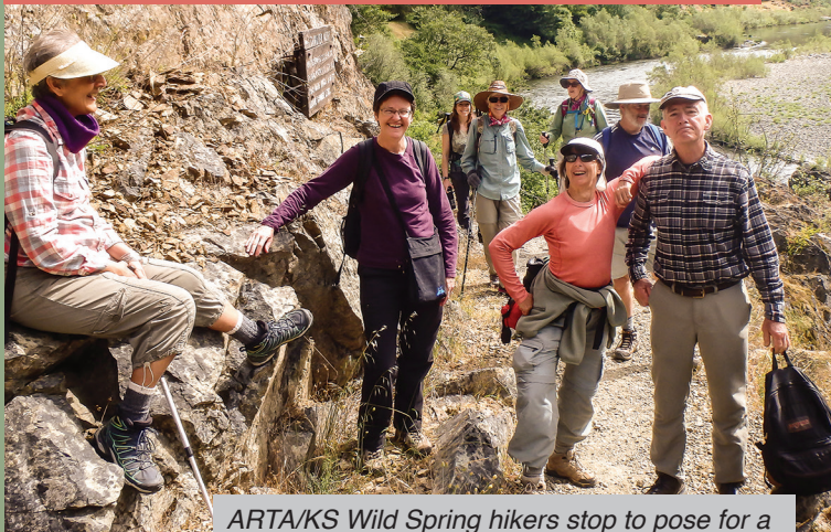
ARTA/KS Wild Spring hikers stop to pose for a picture along the Wild & Scenic Rogue River.