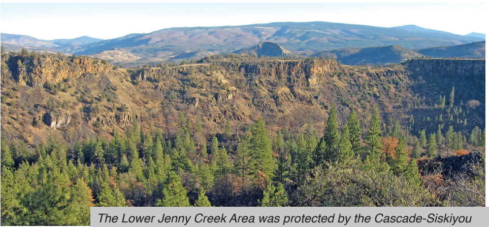
The Lower Jenny Creek Area was protected by the Cascade-Siskiyou National Monument Expansion.