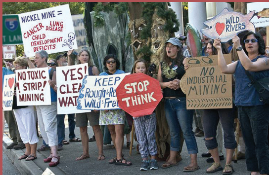
Supporters line-up to show their appreciation for wild rivers.

Join KS Wild to learn about our Activist Toolkit! Learn how you can be involved and take action in local environmental protection efforts while resisting national threats to our public lands. Starting with a potluck and stories of activism, we'll learn about urgent issues on local public lands and take actions that matter. This is a great time to commit to your community!