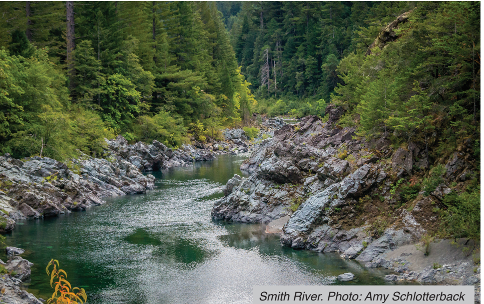
Smith River.

Who we work with – Friends of the Kalmiopsis was central to this effort and has been dedicated to defending this special place for decades. KS Wild also worked with the Kalmiopsis Audubon, Native Fish Society, American Rivers, American Whitewater, Wild and Scenic Rivers, and Smith River Alliance, and many others.