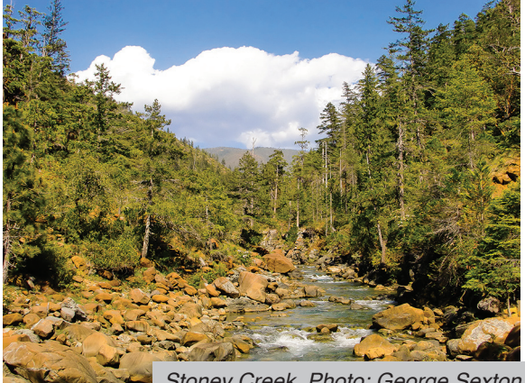
Stoney Creek.

The special magic of this place starts with what you stand on, the heavy metal serpentine soils of the Joesphine Ophiolite. The Ophiolite is a massive sheet of orange peridotite rock pushed up from the seafloor by plate tectonics. Unique plant communities have evolved over millennia to tough it out and at least 70 endemic species that exist nowhere else are found on these strange soils.