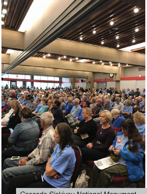
Cascade Siskiyou National Monument supporters show up en masse to a hearing.

Public land is accessible to everyone, providing beautiful places to visit with little to no cost and without discrimination. Public lands offer a reason and place for community to come together. However, we are starting to see efforts in Congress to restrict the use of public lands to benefit large multi-national corporations and their stockholders. It is a critical moment for the public to come together and take a stand against the ruthless few who threaten to take away one of America's best ideas, our public lands.