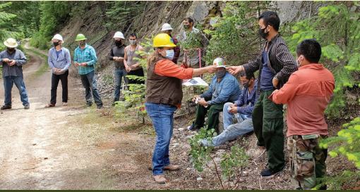
Lomakatsi's Promotora Program conducts trainings on forest worker safety and workplace rights. After each training, the Promotoras de Salud pass out their contact information in case the workers have questions or concerns.

The Rogue Valley is home to one of the most active forestry and wildfire protection service industries in the country and the Latino community constitutes a majority of this workforce. This important work often comes at a cost-forest workers are at high risk of injury, are often paid less than a living wage, and disproportionately experience other equity issues including wage theft. Lomakatsi Restoration Project's Promotora Program provides forest workers with practical information they need to keep themselves safe on the job. Promotoras de Salud (or Community Health Workers) meet with forest workers around the community to deliver training and offer safety resources, primarily in Spanish. The Promatora Program gives a voice to the highly skilled and specialized forest workers who, on a daily basis, make our communities safer from the risk of severe wildfire and enhance wildlife habitat. For more information, check out Lomakatsi's website: https://lomakatsi.org/.