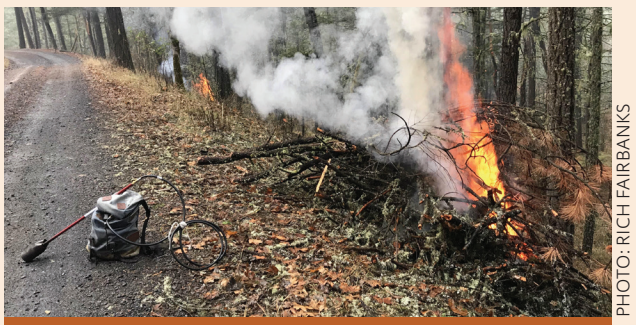
A propane torch is used to set fire to slash piles and conduct prescribed burns.

Slash paper in the middle of a burn pile helps keep debris dry for easy ignition.