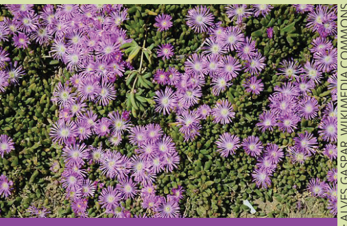
Ice Plant is a very low-growing ground cover with succulent, green foliage.