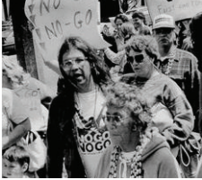
1. G.O. Road Indigenous Blockade (1970-1990).