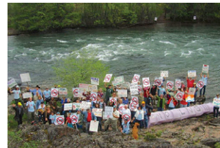
7. The Jordan Cove LNG export proposal has inspired a broad and diverse coalition to stop what would be the first gas export terminal on the U.S. West Coast (14 years and counting).