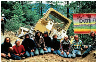
2. Bald Mountain Road Blockade (1983).