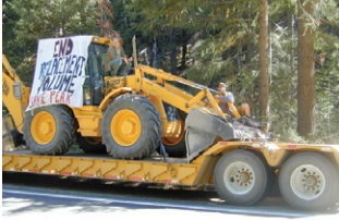
4. Peak Old-Growth Treesit (2002-03).