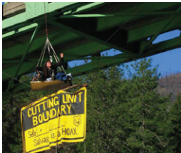
5. Biscuit Salvage Protest (2006).