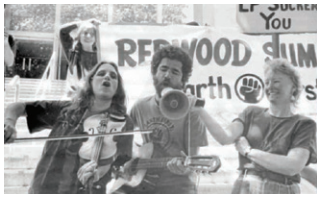
3. Redwood Summer (1990).