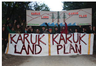
6. Karuk Westside Salvage Blockade. Tribal members defended ancestral lands near the Marble Mountain Wilderness when the Klamath National Forest proposed to clearcut in watersheds important for salmon. (2016).