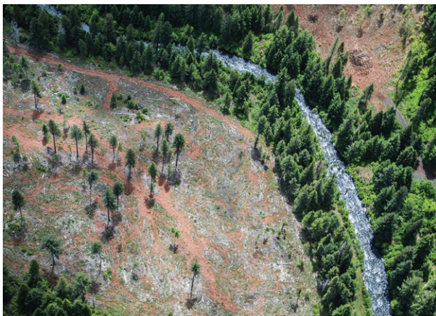
BIG BUTTE CREEK IN THE UPPER ROGUE WATERSHED.

Rogue Riverkeeper, a program of KS Wild, has been leading the charge in support of strong protections for streams in southern Oregon since 2016. Currently, streams that support salmon and steelhead in the Rogue are left with weaker protections than the rest of western Oregon under the Oregon Forest Practices Act. Rogue Riverkeeper also joined with 20 other conservation organizations to submit a petition to the