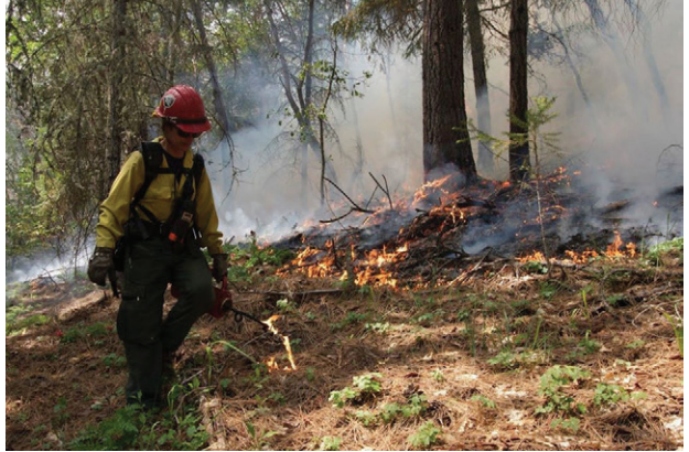
PRESCRIBED FIRE IS KEY TO ADAPTATION IN THE KS.

It is no secret that we need to take action on climate change. We need to reduce carbon pollution and we need to do it right away. When KS Wild took a hard look at climate change in our region, we realized it is the biggest threat to our world-class rivers and exceptional wild places. We now know that we need to develop immediate strategies to directly address how climate change will impact our corner of the world.